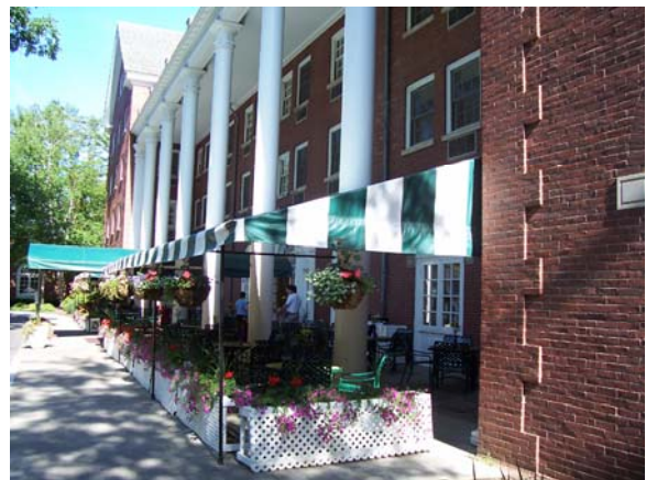
Entrance to the Gideon Putnam Hotel/Café