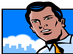
Anonymous Attendee, Co-Chair: "A Dodge Stratus"