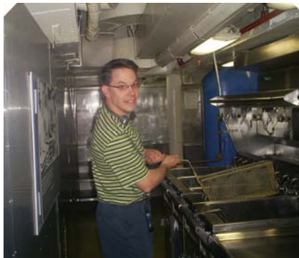
New 'Mc' job for our Former President? No, just role playing aboard the U.S.S Midway during ANI in San Diego.