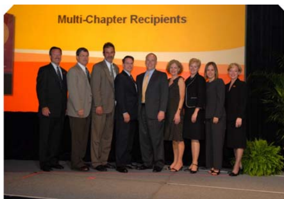
Region 2, 2006-07 Leaders Accepting Awards