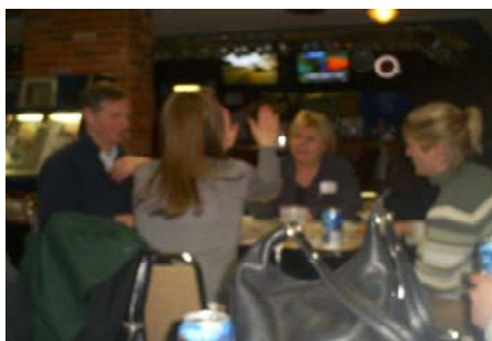
A "High-Five" for a play well done!